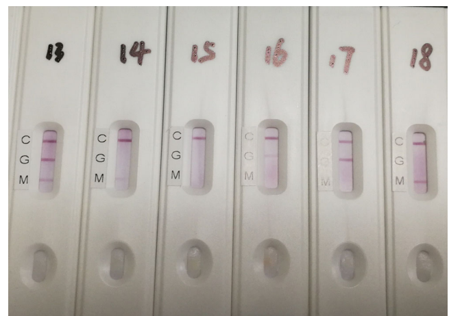
FIGURE 2 Representative photo for different patient blood testing results. (#13) Both IgM and IgG positive, (#14) IgM weak positive, (#15) Both IgM and IgG negative, (#16) IgG weak positive, (#17) IgG positive, and (#18) IgM positive. IgG, immunoglobulin G; IgM, immunoglobulin M

cartridge #15, no IgM and IgG; in cartridge #16 IgG only in low concentration; in cartridge #17 IgG only in high concentration and in cartridge #18, IgM only in high concentration in patient bloods, respectively.